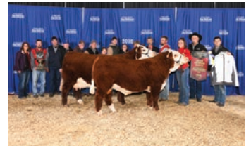
Cameo Girl 45C Grand Champion Female - Dam