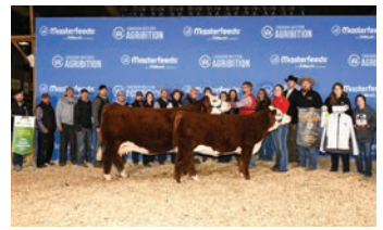
2021 Grand Champion - Dam

Homo Polled. An ET son of the 2021 Agribition Champion Female and Top 10 finalist, Reva 32F. Extra pigment, length of body and explosive hip in this Hodgeman son. A tremendous set of numbers to back this future Herd Bull up! GE•EPD