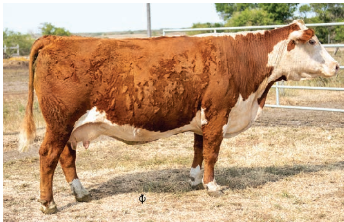
ANL P606 NORTHERN LADY 38X - Dam