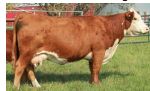
DVL 122G - Dam