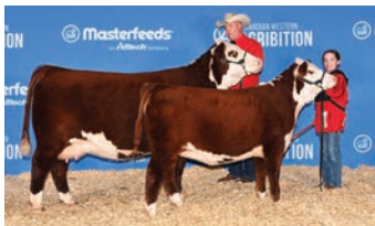
145J - Full Sister to Sire

Powerful 2 year old here that can cover a lot of cows. This guy is stout boned and solid made. Just a mid-April born two year old, who has always been well liked here. If his birthdate wasn't so late, he would have been in the sale last spring. His Sire "Crush" is a full brother to Donor cow Sassy.